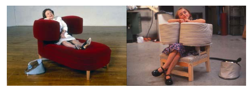
Fig. 4. Wendy Jacob, Squeeze Chaise Lounge , 1998. Red mohair, wood, pneumatic system with pump and hoses.

From as far back as I can remember, I always hated to be hugged. I wanted to experience the good feeling of being hugged, but it was just too overwhelming. It was like a great, all-engulfing tidal wave of stimulation, and I reacted like a wild animal. Being touched triggered flight; it flipped my circuit breaker. ... Many autistic children crave pressure stimulation even though they cannot tolerate being touched. It is much easier for a person with autism to tolerate touch if he or she initiates it. When touched unexpectedly, we usually withdraw, because our nervous system does not have time to process the sensation. (Grandin 1995, page 62)