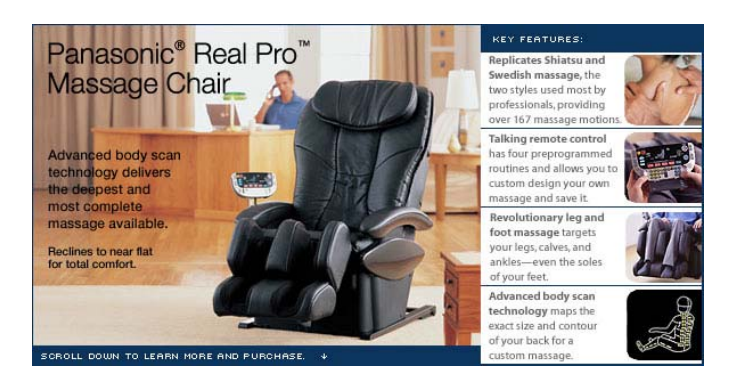
Fig. 3. Panasonic EP3202 Real Pro robotic massage chair provides "Swede-atsu" massage. Image retrieved on 28 September 2004 from http://www.sharperimage.com

While the rhetoric used in the advertisement refers to the embedded technologies as the 'hands' of a human, the advert actually sells mediated touch. This topic was researched by Rachel Maines in her work on early 20<sup>th</sup> century therapy for female hysteria using small electric appliances. Maines found that: "the idea that technologies are deliberately shaped for social purposes is now widely accepted, but the phenomenon of camouflage is less familiar." (Maines 2001, page 117) The word 'camouflage', according to Maines, means that the advertising rhetoric of products conveys what the item offers without endorsing all of their possible uses.